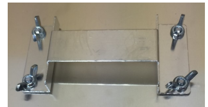
Integrated Mounting Plate